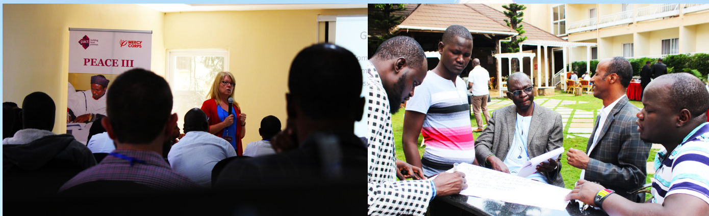
Left: PEACE III Chief of Party addresses implementing partners during a capacity development and reflection workshop in Nairobi on May 29-31, 2018. Right: A section of implementing partners discussing sustainability of PEACE III impact. PEACE III partners – Pact, Mercy Corps and a host of 17 local implementing partners from both Somali and Karamoja Cluster – convened in a forward-looking meeting to discuss organizational sustainability, impact sustainability, and approaches sustainability. The partners also had a chance to hear from USAID/Kenya and East Africa Mission' Deputy Chief, Democracy, Governance and Conflict Office, Ms Amy Hamelin, on new developments in USAID and proposal and budget development process. The partners also had a chance to seek clarification on legal issues in USAID countering violence extremism programming from USAID regional General Attorney, Mr Bert Ubamadu.