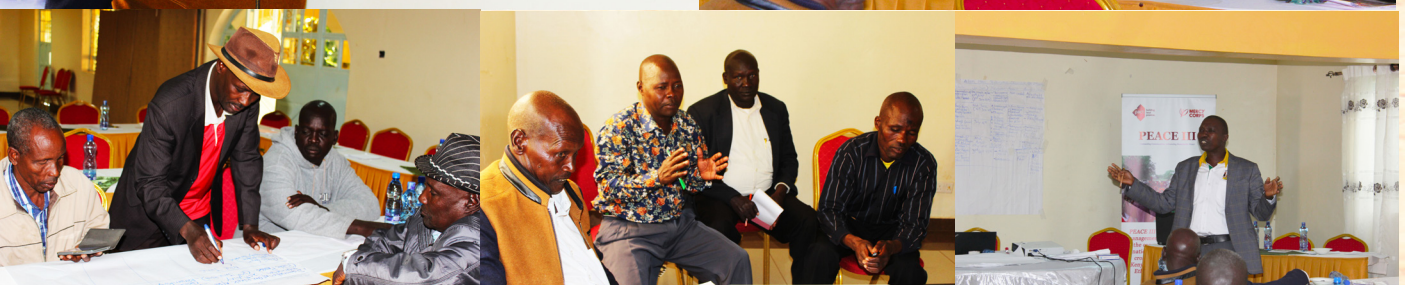
Various sessions and presentations during the chiefs' forum.