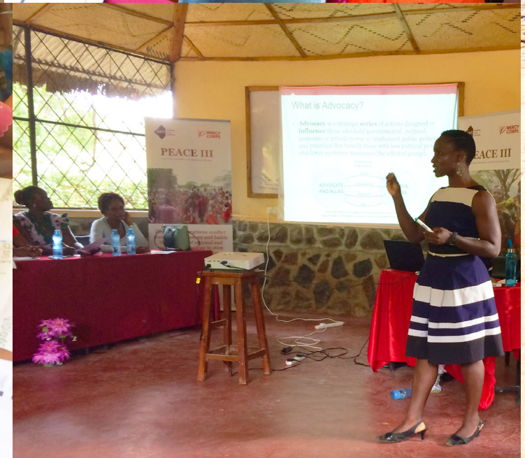
Sessions during the advocacy training.