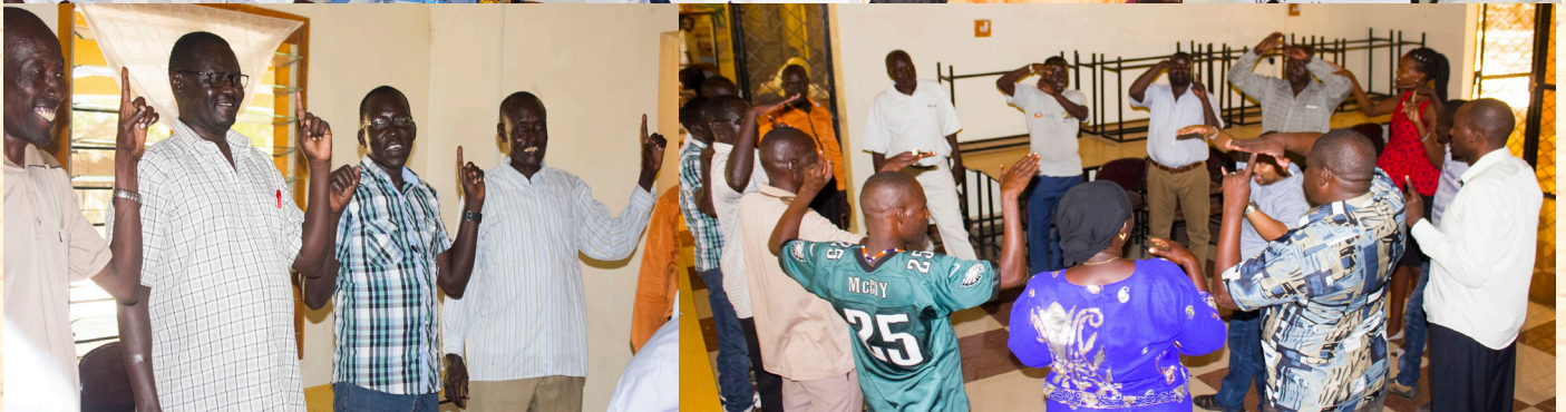
Participants during different sessions of the conflict early warning early response training for Turkana County Government Officials and community peace monitors drawn from conflict hotspots in Loima and Turkana West sub counties.