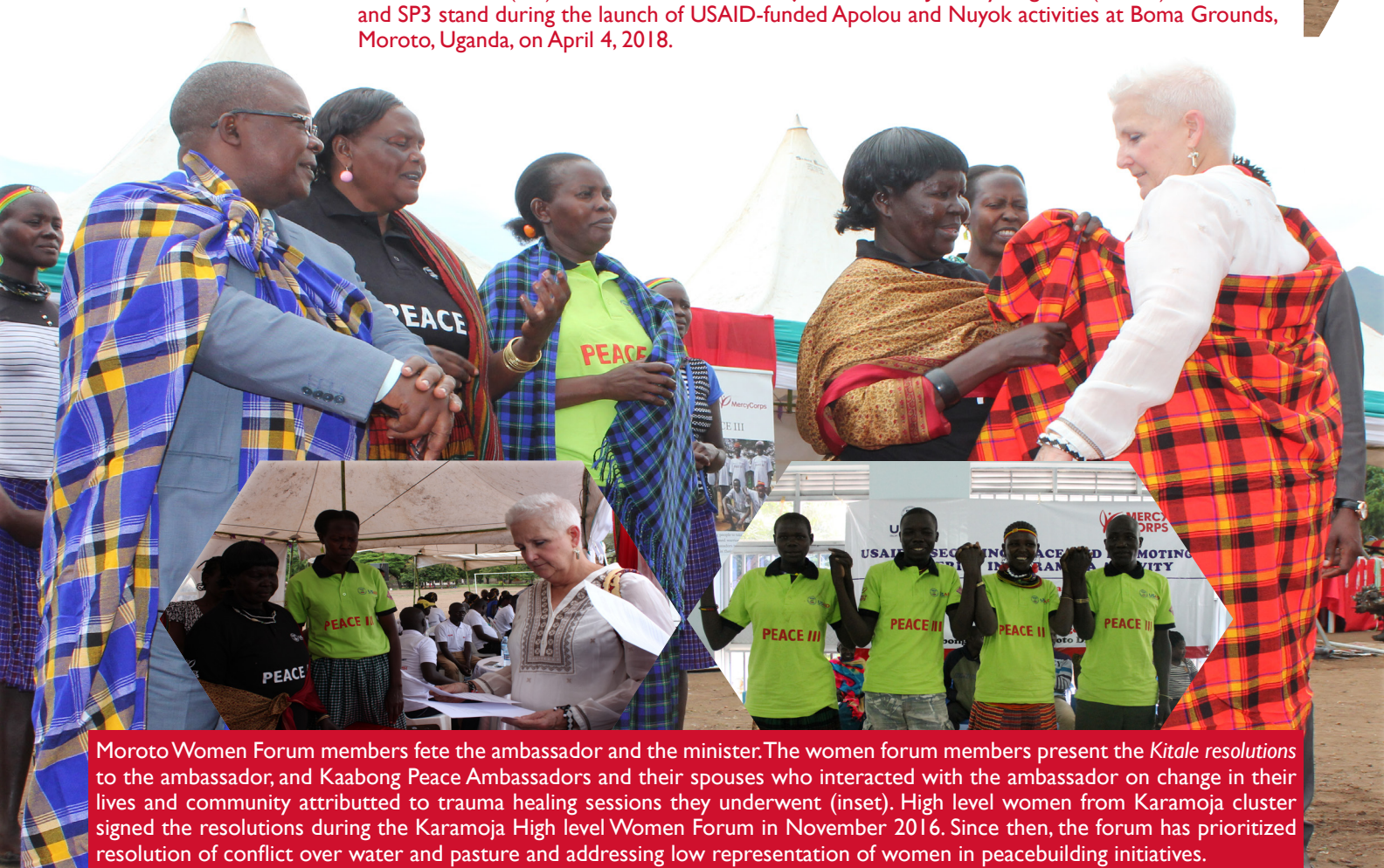
Moroto Women Forum members fete the ambassador and the minister. The women forum members present the Kitale resolutions to the ambassador, and Kaabong Peace Ambassadors and their spouses who interacted with the ambassador on change in their lives and community attributed to trauma healing sessions they underwent (inset). High level women from Karamoja cluster signed the resolutions during the Karamoja High level Women Forum in November 2016. Since then, the forum has prioritized resolution of conflict over water and pasture and addressing low representation of women in peacebuilding initiatives.