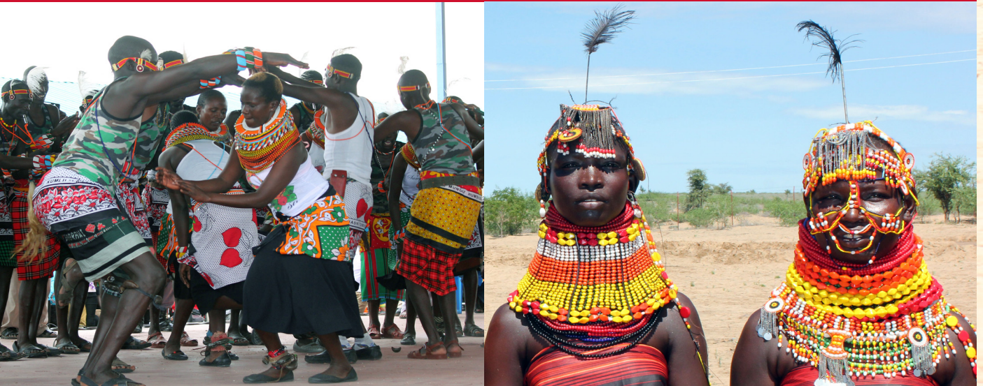
Samburu dancers. Right: Turkana girls in cultural regalia.