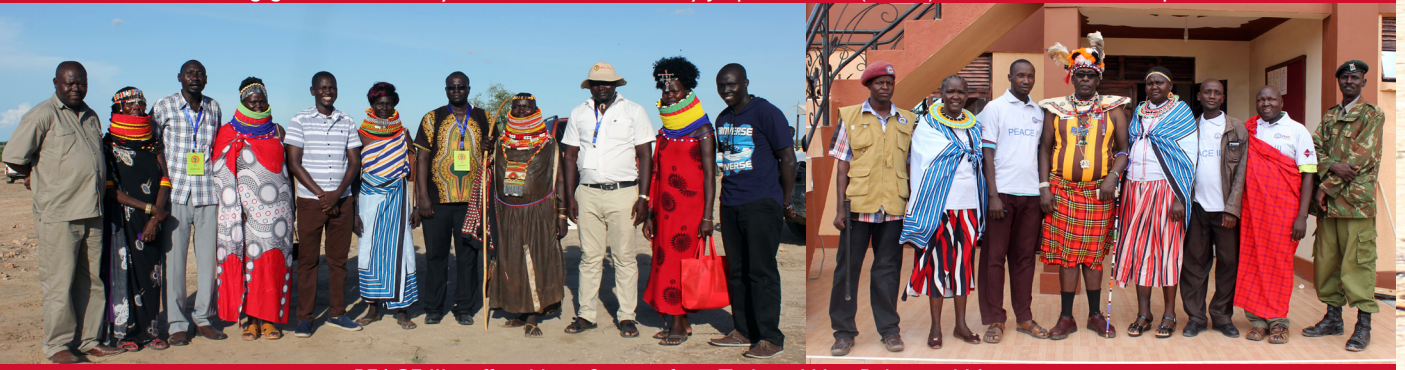
PEACE III staff and beneficiaries from Turkana, West Pokot and Moroto.